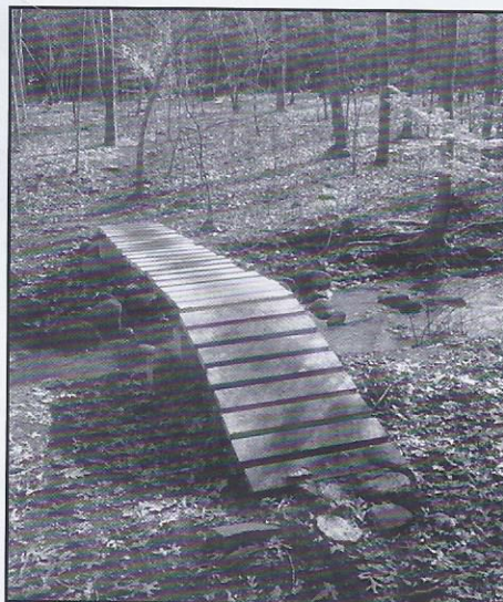
New Bridge at Trumbull.