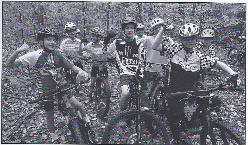
Fairfield County Youth Cycling Teams member getting it done at Troutbrook.